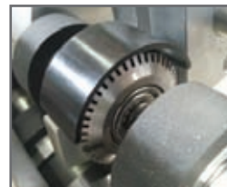
Linear Perf Standard