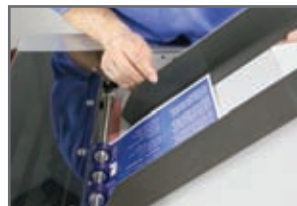
Top Friction Feed