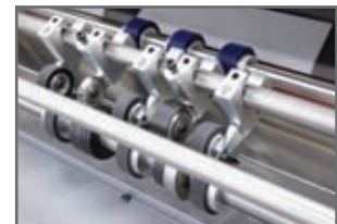
Linear Score Standard

The COUNT™ PerfMaster Sprint is a simple-to-use top-feed perforating and scoring solution that gets the job done quickly – with speeds of up to 12,000 sheets (8-1/2" x 11") per hour.