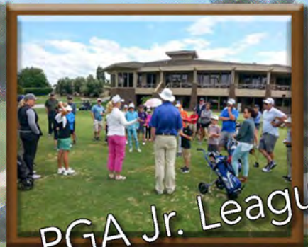
PGA Jr. League!