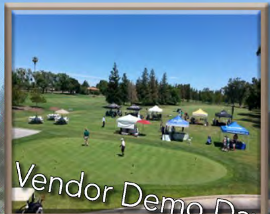
Vendor Demo Day!