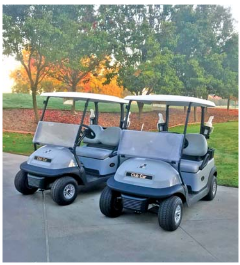
Our new fleet of platinum golf carts features USB ports and amenities in each vehicle.

These efforts are designed to keep the course playable throughout the winter and provide the best playing conditions for the members.