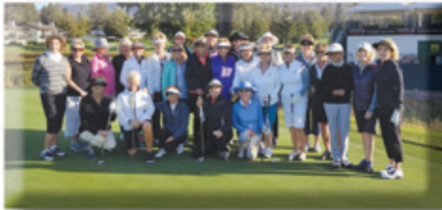
Silverado "Meet & Greet" Cocktail Party