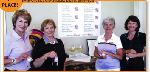
3 WAY TIE FOR 1 ST PLACE!