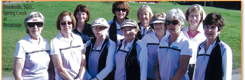
Brookside, SGCC, Spring Creek at Brookside