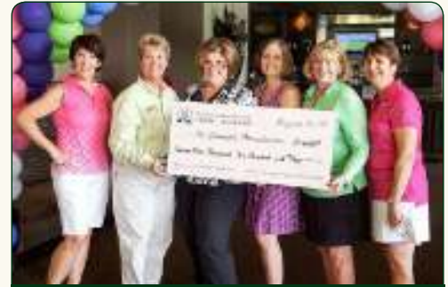
Check Presentation to St. Joseph's Foundation