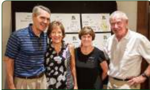
Twilight Golf Winners - Butterfield's and Lane's