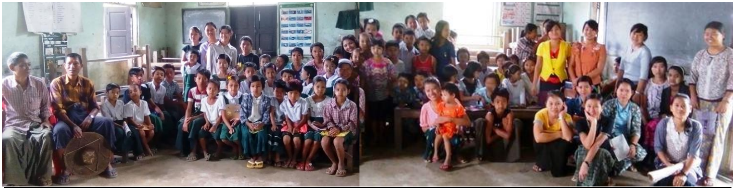
FED Trainees conducted a children's camp in March 2015 for the village children in Pathein