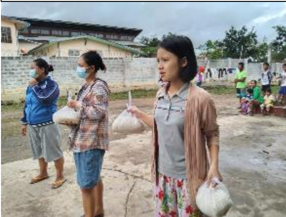
Distributing rice bags