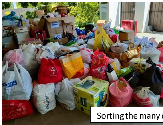
Sorting the many donated items