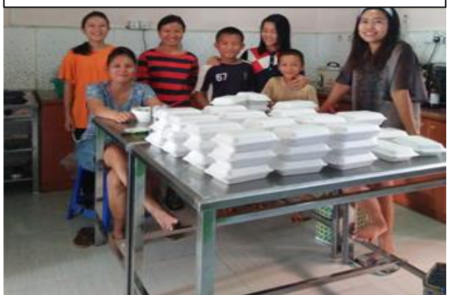
Packed fried noodles for the children