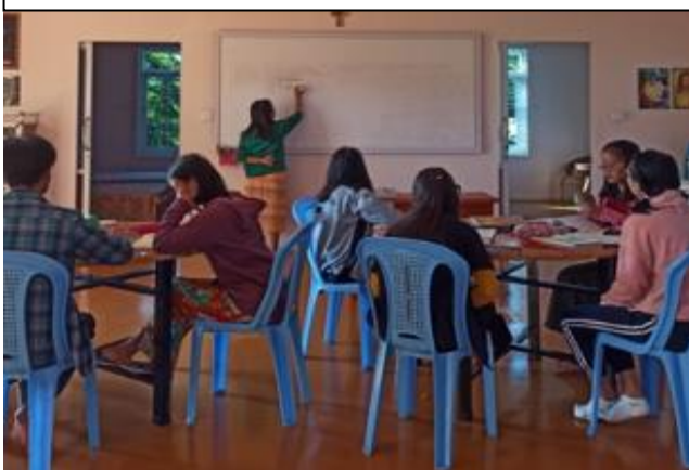
Teaching writing skills to the teenagers