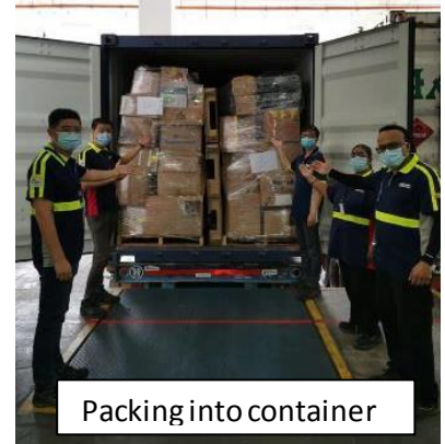
Packing into container