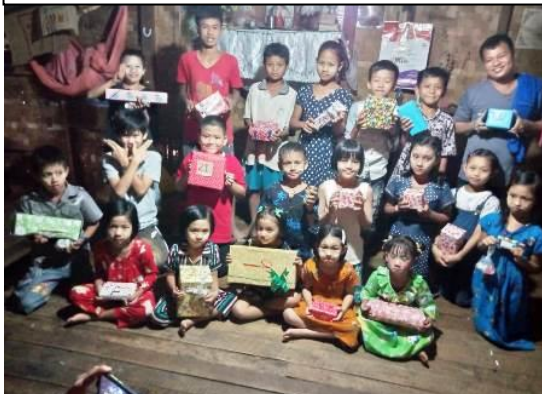
With the children in the village