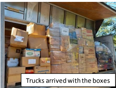
Trucks arrived with the boxes