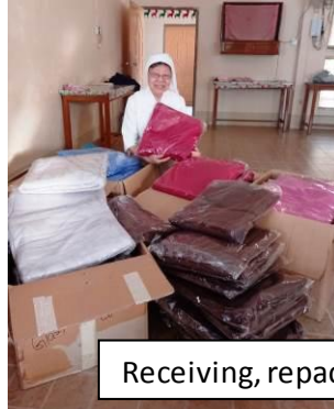
Receiving, repacking & distributing the donated items