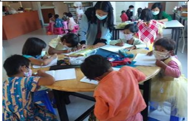
Group teaching for different age groups of children from the neighbourhood