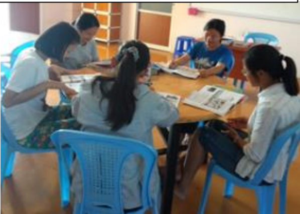
Students from the 4 th Batch continuing with their training