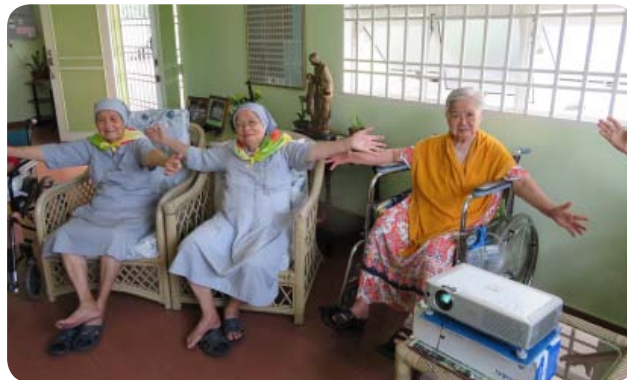
Praise the Lord!