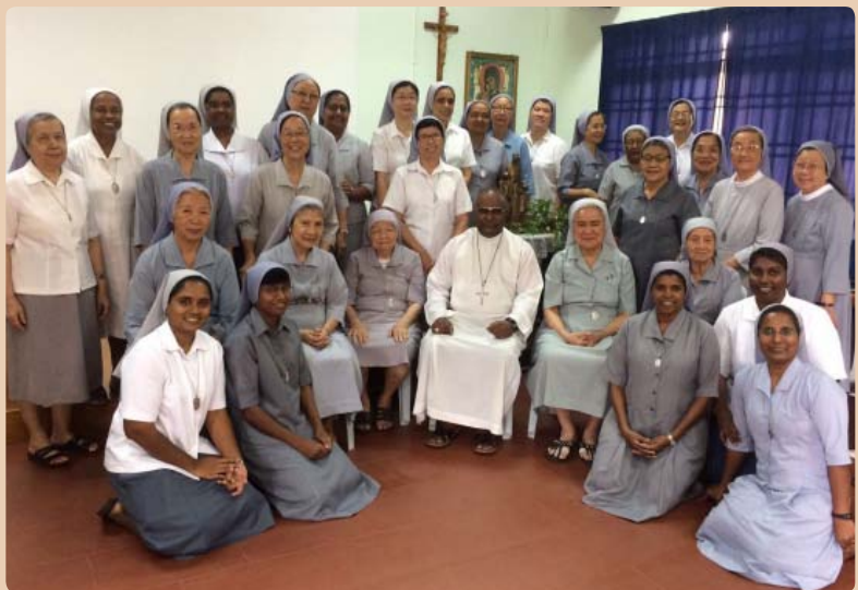
Small in number but joyful in spirit.