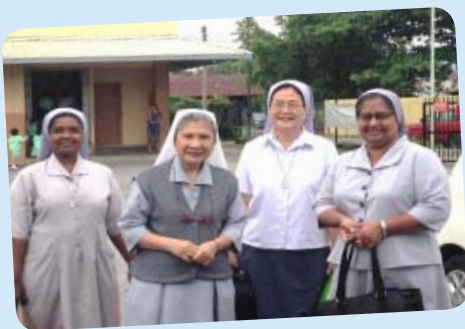
WARM WELCOME by the children of our Canossian Kindergarten and Sisters