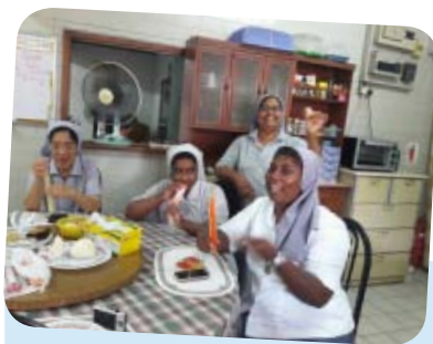
Recreating together at the Sisters' House