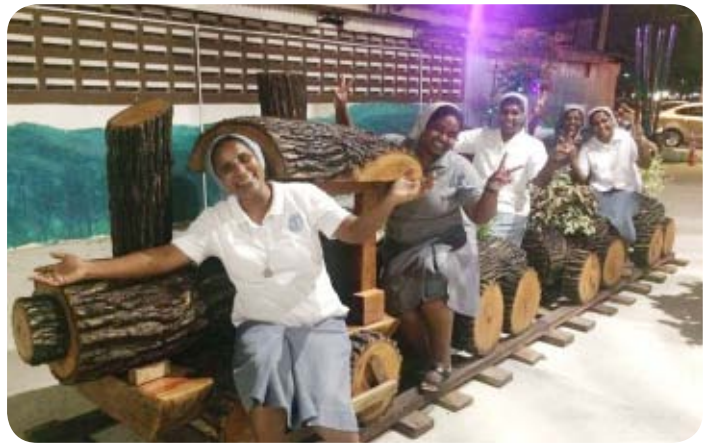
Greenies on the move

After our “Canossian Heritage” we the Greenies travelled to the “Street Gallery” in Kluang town for integration and recreation. We had glimpses of the reality of Malaysia on the walls of many shop lots. We were fascinated with the beauty of God creations and giftedness of our young Malaysian artist of today. As we admired the wonder of God on each picture, we too had fun and allowed the ‘childlikeness’ within us to dance according to the rhythms of the pictures.