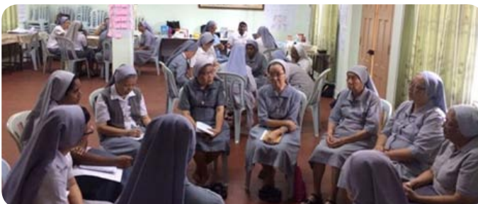
Intense group discussion, joy of listening to one another