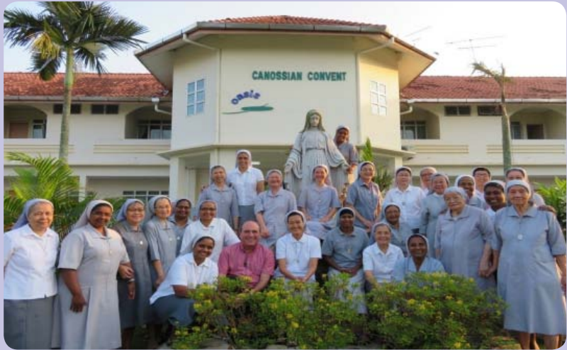
The group together after Retreat. The Joy of knowing our Imperfections yet loved beautifully.