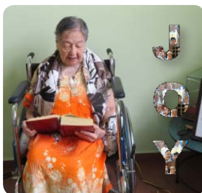
The Word of the Lord