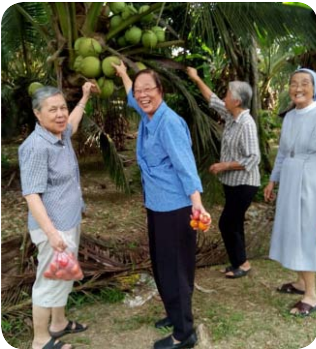
So cooling and refreshing, young coconuts, so low I can get it...