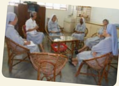
Giving lesson to the Community