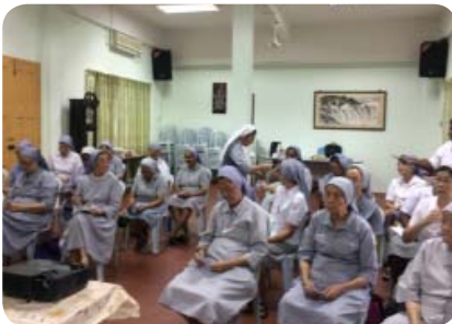
Assembly of sisters, listening so very intently