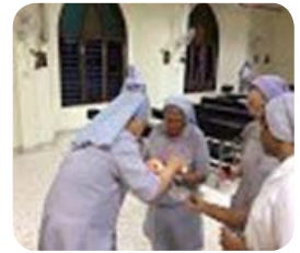
Para Liturgy and welcoming in Kluang