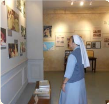
At the Canossian Heritage Gallery, Sacred Heart Convent