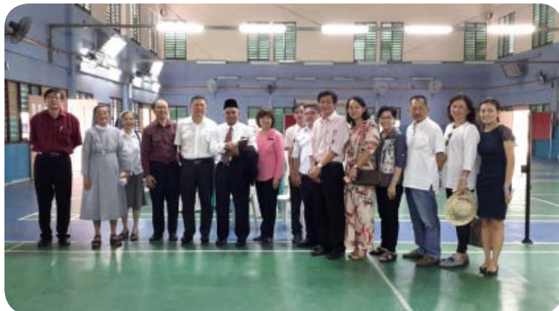
Meeting of the minds at SMKCC, Kluang