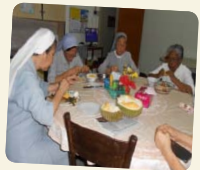
Enjoying a meal with the Community Sisters