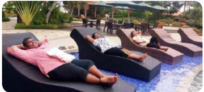
Relaxing and enjoying the togetherness

Then the Greenies moved into “Bayu Marina Resort” for Resting, Relaxing, Recreating, Rewinding, Reflecting and Rejuvenating. How we do it? Through sharing, swimming, sauna, feasting and visiting.