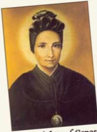
St. Magdalene of Canossa 1774 - 1835 Memorial - 8 May Foundress of the Canossian Sisters Daughters of Charity, Servants of the Poor "Making Jesus Known and Loved"