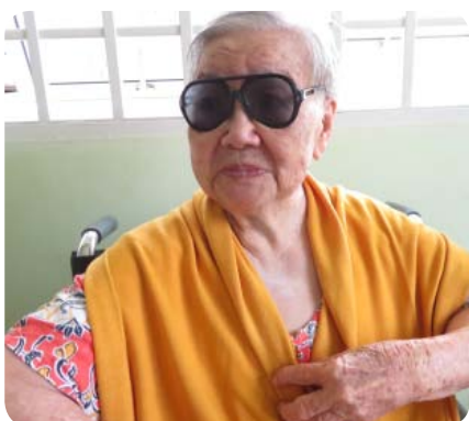
A penny for your thoughts...?