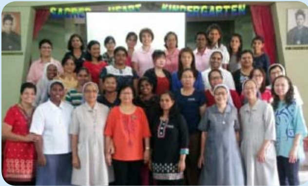
The coming together of our Kindergarten teachers and Sisters in Malacca for Formation