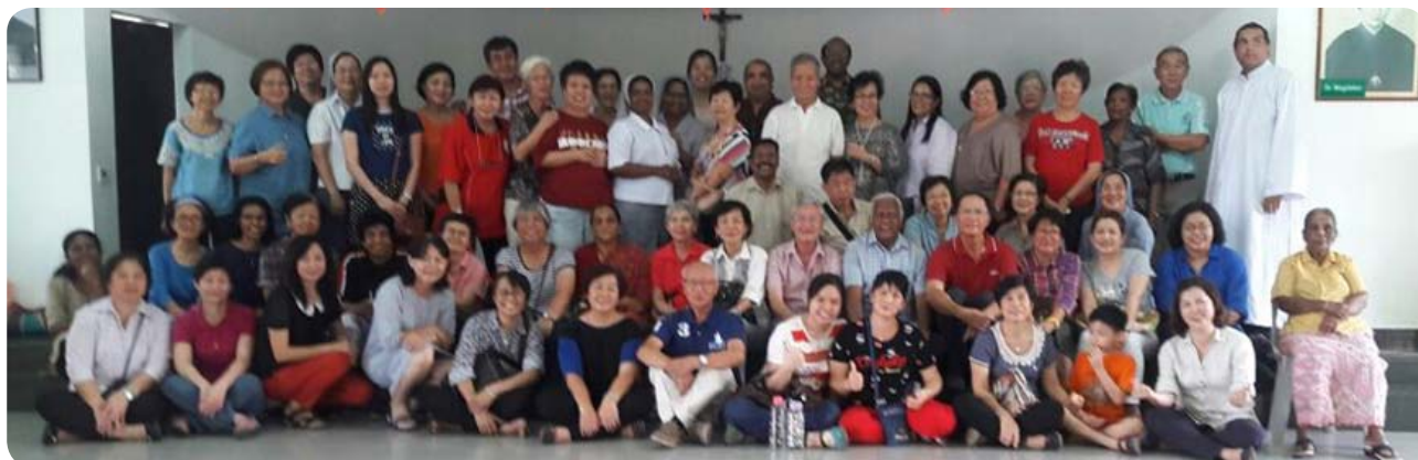
The participants gathered in Jinjang Convent for Mass, Healing and Lunch