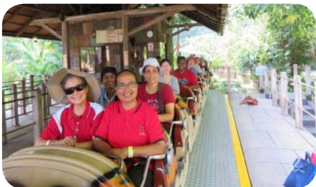
A joy ride together