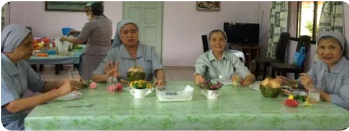
High Tea with the Provincial Council