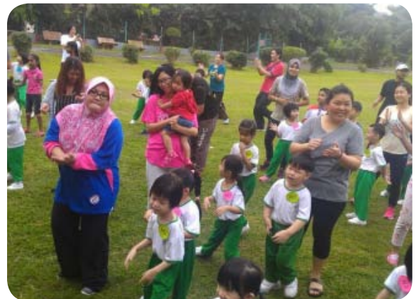
Parents' participation at Tadika Canossian Segamat