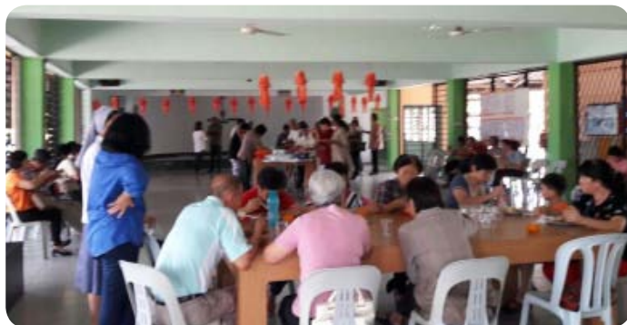
The group from Kajang, all engrossed in dialogue