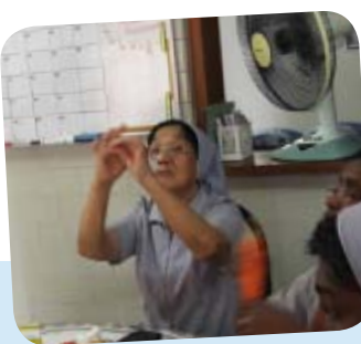
Awwwww!!! So nice.