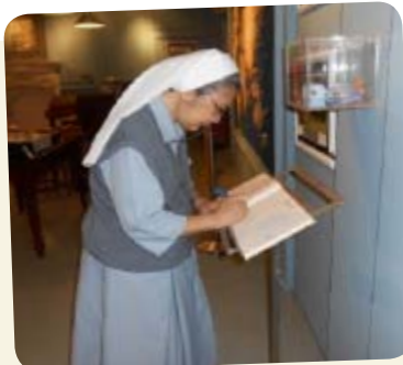
Signing the Visitors' book