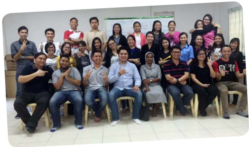
With the Youth .....