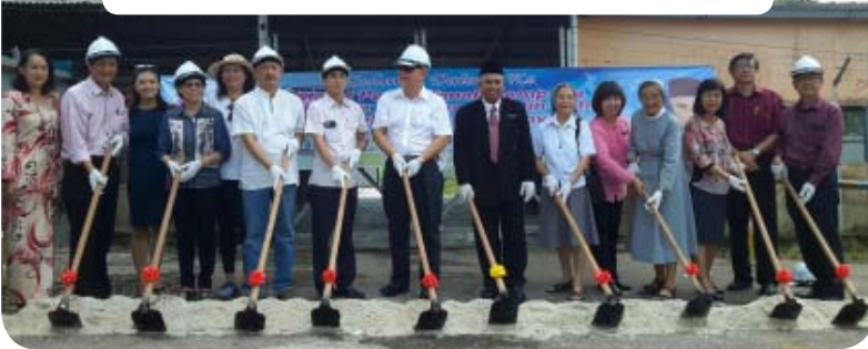
Launching of the new school canteen in Kluang

The new school canteen for the primary and secondary students of Canossian Convent Schools, Kluang is now a reality