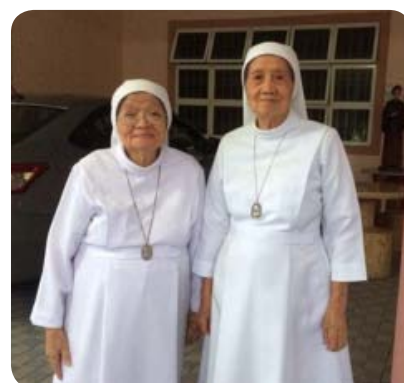
The two cousins "LIMS"