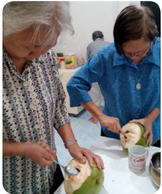
This is REALLY GOOD! ...