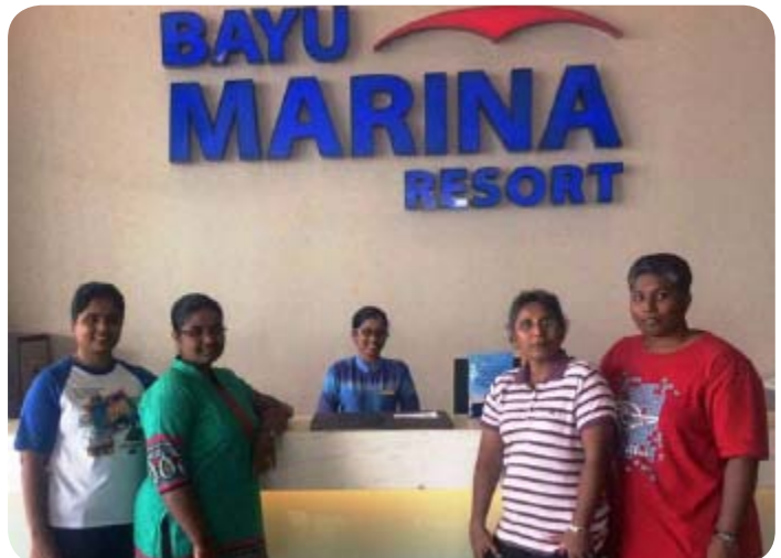
Welcome to “Bayu Marina Resort”

After all the rewinding, now we were back to our “Home Sweet Home” Oasis to quench our thirst and proceed with the Juniors’ meet. This is another opportunity that the Lord created for us to revisit our own “Religious Calling” following the path that Magdalene herself travelled, called the CANOSSIAN MAP. Once again the Spirit led us to a deeper encounter with the Lord and with each other. The reflection and the exercises helped each one of us identify our own PERSONAL and CANOSSIAN MAP. The sharing of our own journey has enriched, affirmed, challenged and strengthened our bonding with each other. In the end the Greenies were glad to walk away with the greater understanding of our womanhood and how we live it learning from our foundress Magdalene of Canossa herself.