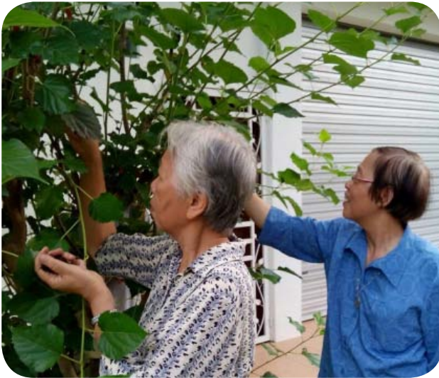
Looking for the hidden treasures?