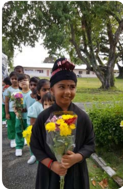
Celebrating the feast of St. Magdalene by the Kindergarten children in Sungei Siput