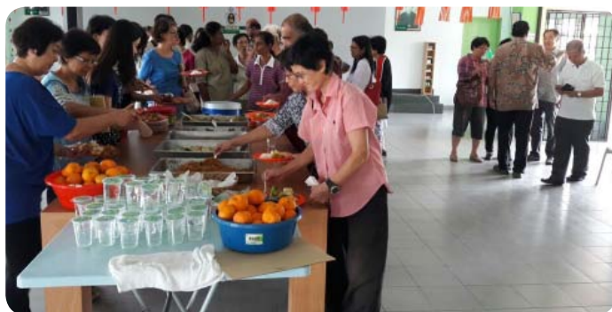
Meals and fellowship