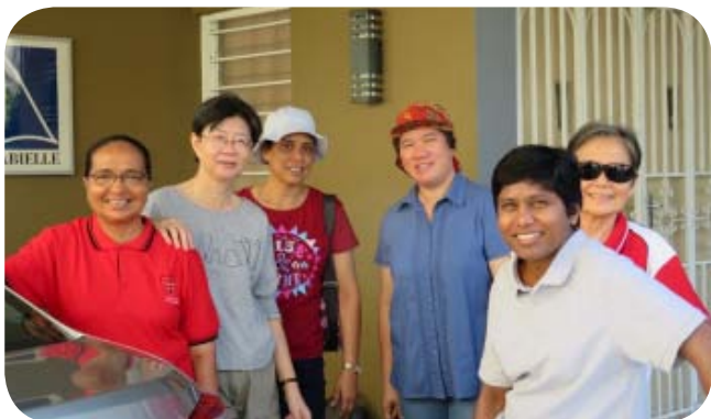
At the Lost world in Ipoh