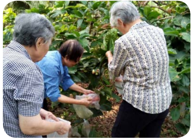
What is that?...