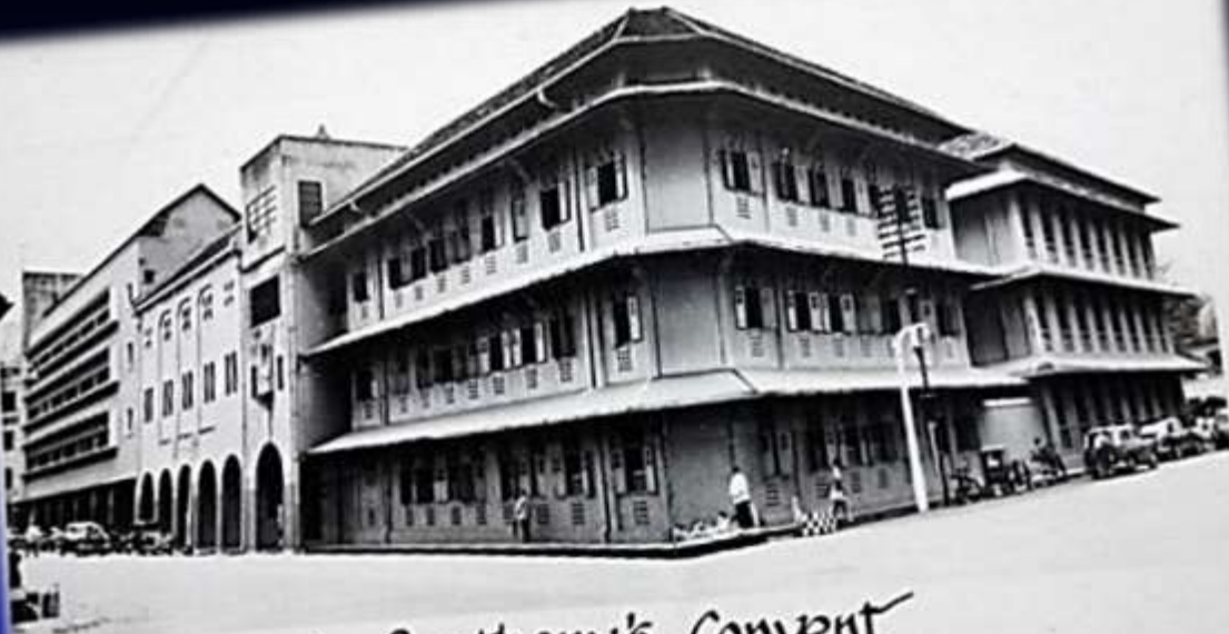
St. Anthony's Convent Singapore