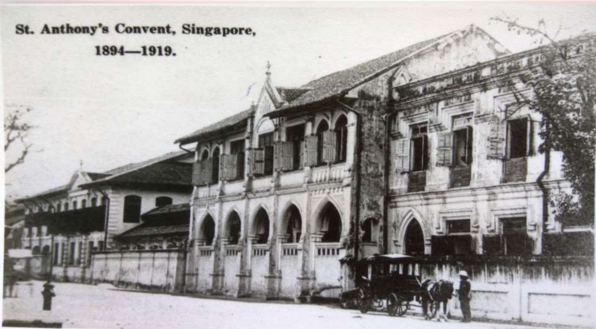
St. Anthony's Convent, Singapore, 1894—1919.