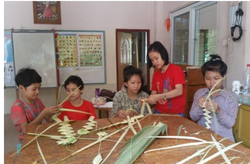
Children at Canossa Home in Thanlyn preparing palms for Palm Sunday.