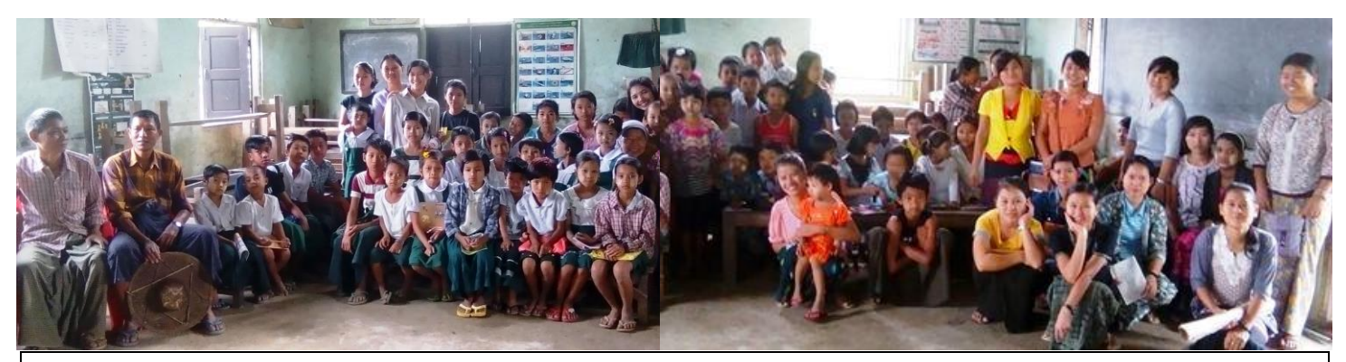
FED Trainees conducted a children's camp in March 2015 for the village children in Pathein