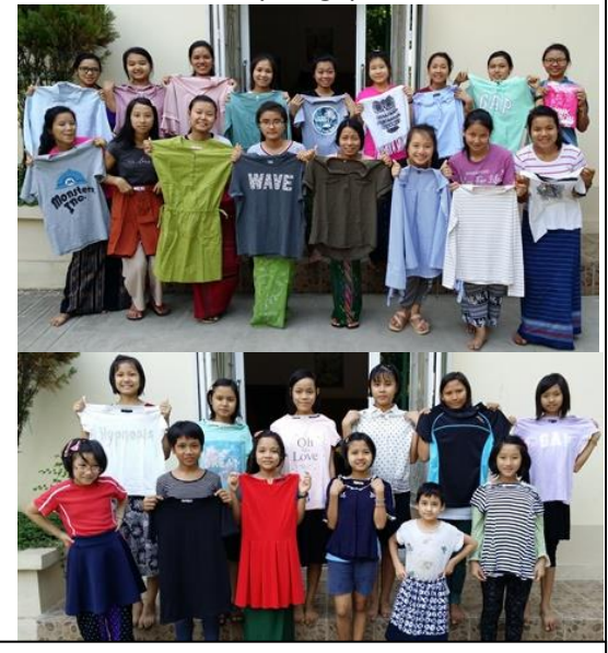
We pray daily for all our benefactors, volunteers, supporters & friends.

Educators & children were so happy to choose what they liked from the pre-loved clothes donated by Singapore friends.