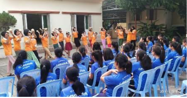
They visited Gate of Hope at Nyaung Shwe on 11 Nov. to find out about the hospitality training programme.