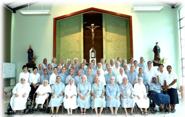
Province of Singapore- Myanmar with the General

All wonderful and enjoyable events have an ending and soon we bade farewell to our Sisters, who were leaving early the following morning for their canonical visit to Timor Leste and Australia.