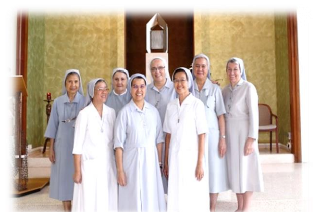
General Council and Provincial Council of Singapore- Myanmar