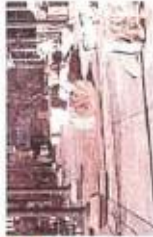
LARGE SLAB LIMESTONE FOR SEATING AND INTRODUCTION OF NATURAL MATERIALS TO THE PLAZA.