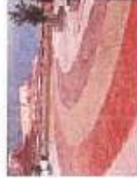
STAINED CONCRETE PAVEMENT TO PROVIDE VISUAL INTEREST AND EXPRESSION OF MOTION THROUGH THE PLAZA.