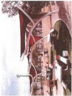
SUN SHADE STRUCTURES PROVIDING PROTECTION, ARTISTIC EXPRESSION AND VERTICAL STRUCTURE WITHIN THE PLAZA.