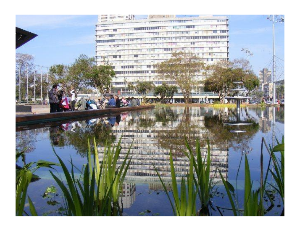
Fig.4 Municipal Building of Tel Aviv – Jaffa reflected in the ecological pool