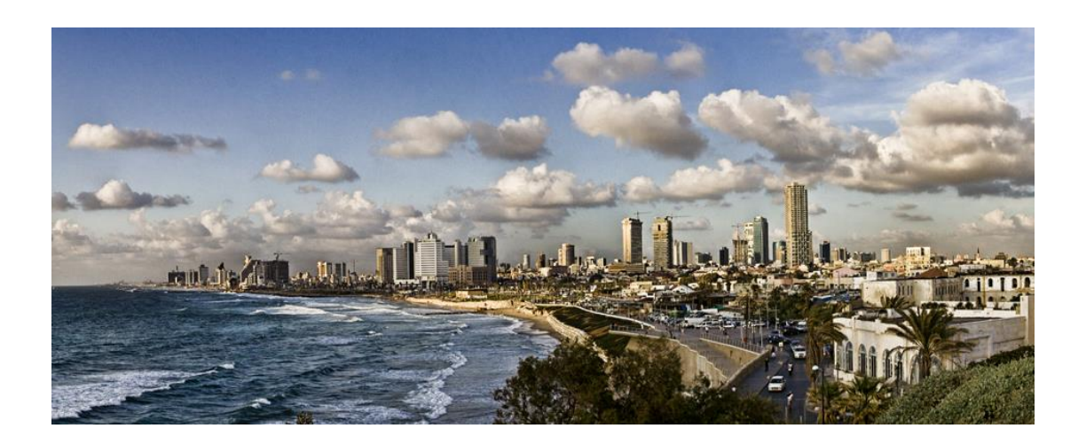
Fig.6 Photo of the Tel Aviv-Jaffa seacoast