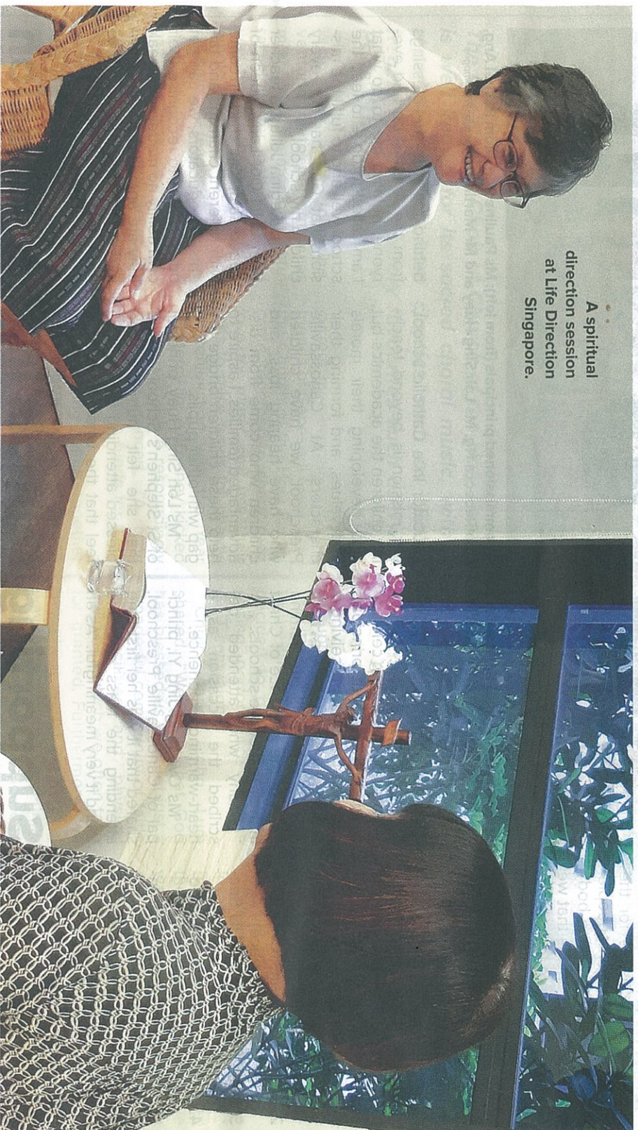
A spiritual direction session at Life Direction Singapore.

Our priests are people like us: with imperfections, weaknesses and prone to temptations. Together we – the People of God must journey and encourage and pray for our priests so that they can make available to us (by the grace of their ordination) the Sacraments that will give us strength on our pilgrimage on earth.