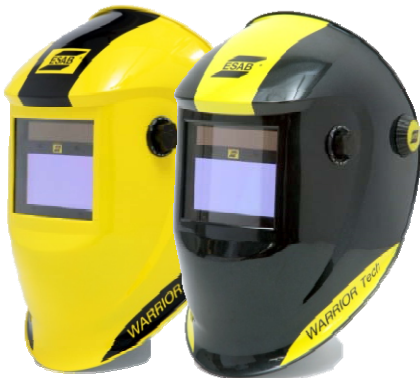
Lightweight helmet 520g

The WARRIOR™ Tech helmet provides ideal functionality, performance and comfort to the occasional welder, maintenance and construction workers through to the professional welder.