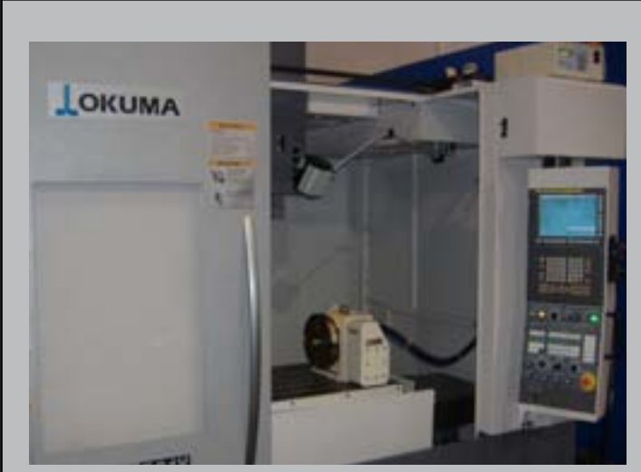
RNA-250 with TPC Jr

If a manufacturer needs 5-axis machining capabilities and their CNC does not support 5-axes, they can always consider retrofitting the machine with a new FANUC control and a new rotary table. This option may not be practical in all cases, but if the machine tool is mechanically sound, the cost of a 5th axis rotary table and a control upgrade may be an attractive alternative to purchasing a new 5-axis machining center.