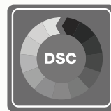
Drum Speed Control