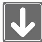
Low Energy Consumption