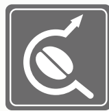
Thermosiphon Heat Exchange