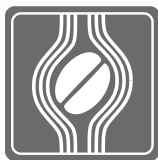
Fluid Bed Roasting