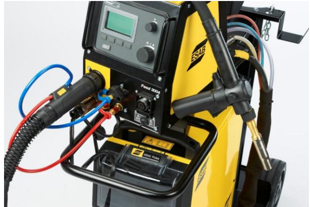
Aristo® Feed 3004 U6 and MXH 400w PP

SuperPulse™ (U8 2 ) is the optimum MIG/MAG process for control of the heat input or bridging of variable gaps.