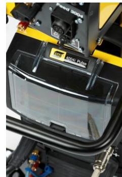
Compartment for wear parts