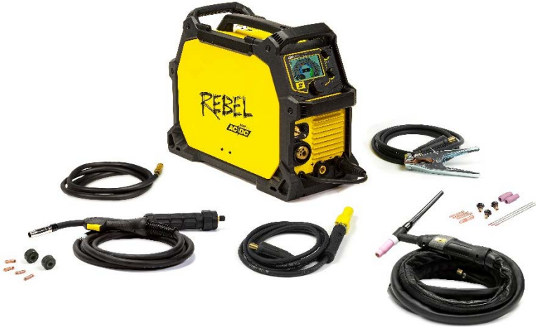
Rebel EMP 205ic AC/DC and accessories.

We made the impossible possible with the first-ever portable, all-process machine, complete with MIG, Flux-Cored, MMA, DC TIG, and now AC TIG capabilities, which means – yes – it TIG welds aluminium. It is a TRUE all-in-one welding system that delivers best-in-class performance in each process in the most portable, durable, go anywhere, weld anything industrial package on the market today.