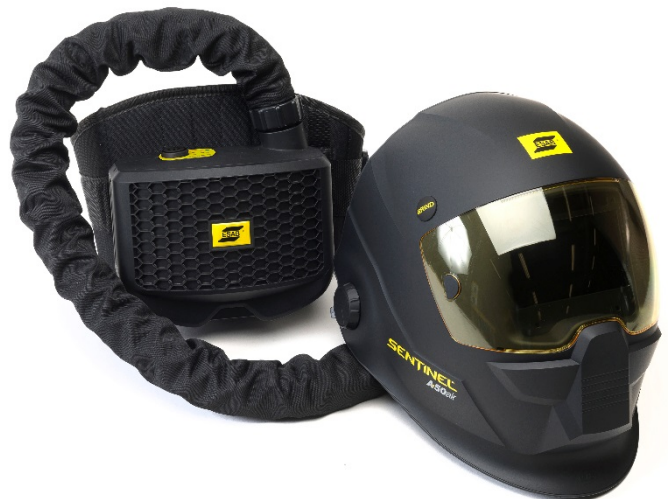
SENTINEL A50 Air with ESAB PAPR unit